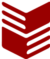
Faculty of Economics and Business Administration